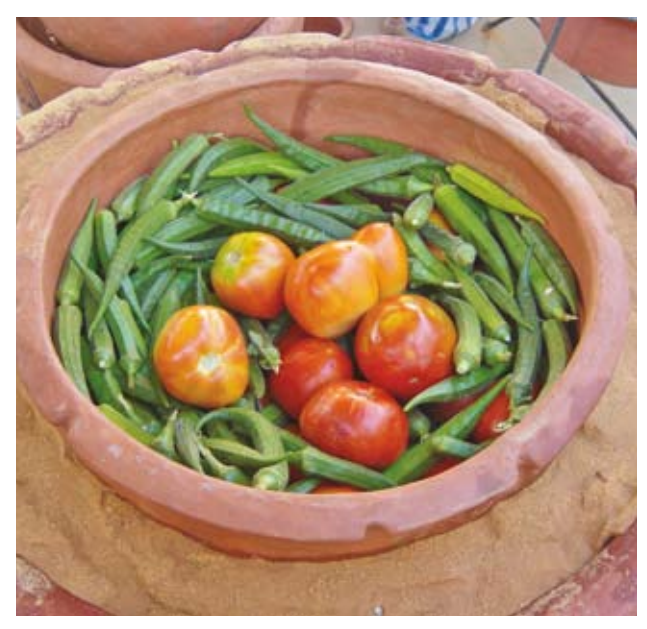
Pic 11. An assembled refrigerator using sand for insulation.