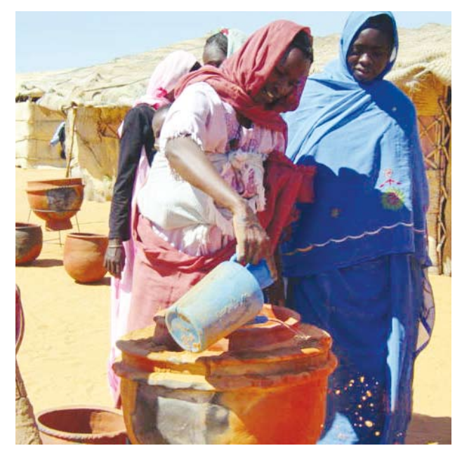
Pic 9. When the refrigerator is assembled water is poured on the sand.