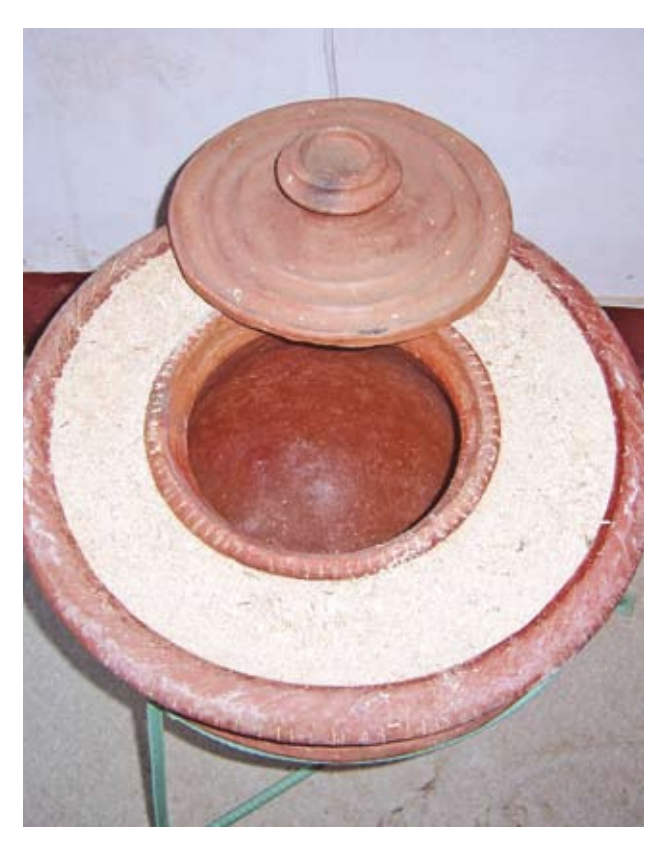
Pic 10. An assembled refrigerator using wood chippings for insulation.