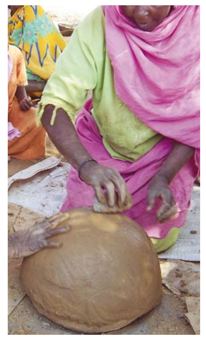
Pic 5. Using water and a stone the surface of the mixture is smoothened.