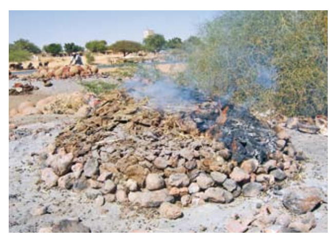
Pic 7. The pots are burned under a pile of rocks and cow dung.